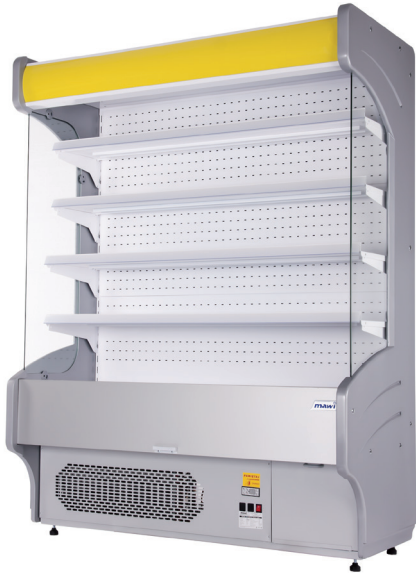
GLASS SIDE VERSION