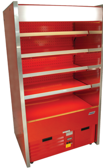
FULL SIDE VERSION